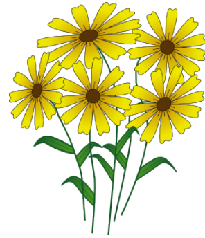
FAVORITE FLOWER CONTEST