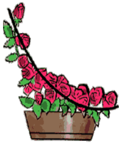
CONTAINER GARDENING CONTEST

What are COLOR-ONS? They are transfers that we now have for each of our youth gardening national contest sections. There is one for Big Pumpkin, Giant Sunflower, Container Gardening, Favorite Flowers and Perfect Plants. Also, we have one for our year-round Octopus recognition program. Color-ons can be ordered by the club from national to be used however they wish and whenever they wish. Simply color the transfer, then position it on the white or light colored shirt (to be brought in by the youth or adult) image side down and press for 30-40 seconds. Next, let it cool, remove paper backing and wear. They can also be used to put on bags, etc. Directions are on the back of the transfer paper. If clubs are doing this at a meeting all you need are the color-ons, some crayons and an iron. You can provide shirts if you want or just have them bring their own. This is a good way to attract youth, parents and grandparents to your meeting or special event.