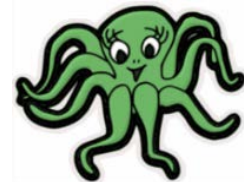
OCTOPUS RECOGNITION PROGRAM