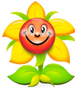
GIANT SUNFLOWER CONTEST