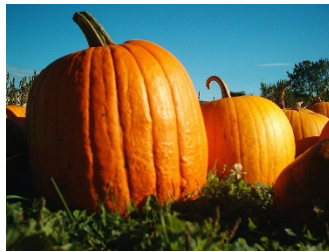
BIG PUMPKIN CONTEST